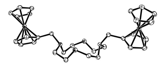
Fig. 1 ORTEP^{17} view of 4 showing thermal ellipsoids at a 50% probability level. Hydrogen atoms are omitted for clarity.

Moreover, an exceptional selectivity was also observed when reacting cyclen with dialdehydes, thus providing a very straightforward route towards three-dimensional macropolycycles. For instance, new cryptands 5 and 6, bearing a dibenzofuran and a diphenylether handle, respectively, can be prepared by a very convenient one-pot procedure in 75-78% yield. The [1 + 1] condensation of cyclen and dialdehyde has been evidenced by mass spectrometry and X-ray diffraction. The only discrepancy between cryptands 5 and 6 is the presence of a C-C bond between the two phenyl groups, which makes the handle planar in 5. Consequently, these two compounds adopt different geometries both in the solid state and in solution, as shown by their NMR spectra. Indeed, the two protons of each methylene group of the handle in compound 6 are diastereotopic and appear as an AB system in the <sup>1</sup>H NMR spectrum, either at room temperature or at 200 K, proving that the cryptand exhibits C_2 symmetry, similar to that observed in the solid state for the corresponding Cu(II) complex (Fig. 2).<sup>‡</sup> In