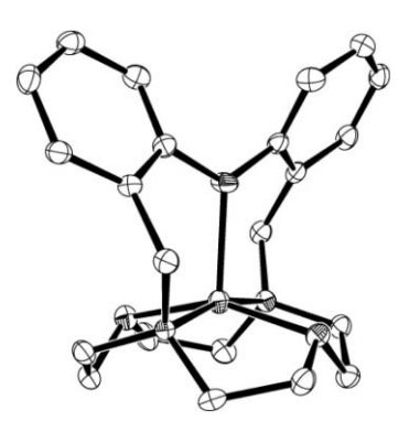
Fig. 2 ORTEP^{17} view of the Cu(II) complex of 6 showing thermal ellipsoids at a 50% probability level. Hydrogen atoms are omitted for clarity.

contrast, the <sup>1</sup>H NMR spectrum of the cryptand incorporating the rigid dibenzofuran unit, recorded at room temperature, shows only one singlet for the protons of the methylene groups linking the dibenzofuran to the cyclen. This singlet splits into two doublets upon lowering the temperature (Fig. 3). This feature can be attributed to a swinging motion of the handle that occurs rapidly at room temperature on the NMR time scale and considerably more slowly at 200 K. This structural study suggests that these two cryptands should possess very different ligating properties.